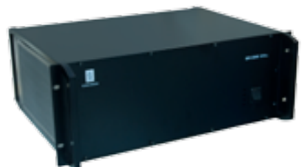
Processing Unit (PU)