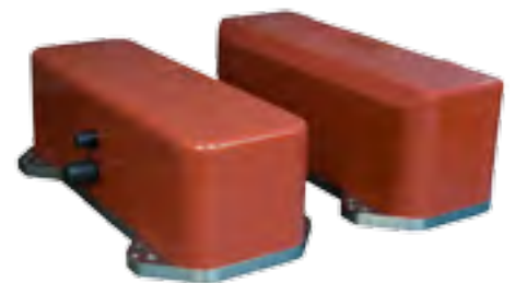
Transducer array (Rx/Tx)