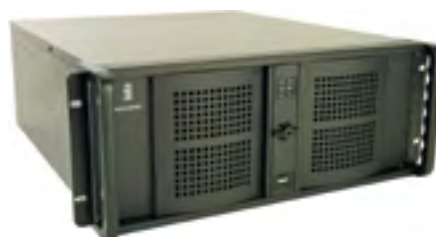
Hydrographic Work Station (HWS)